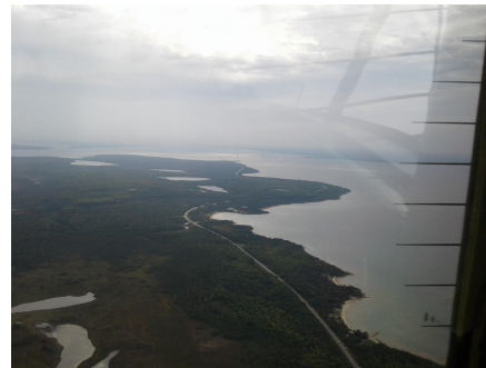
Upper Peninsula, MI