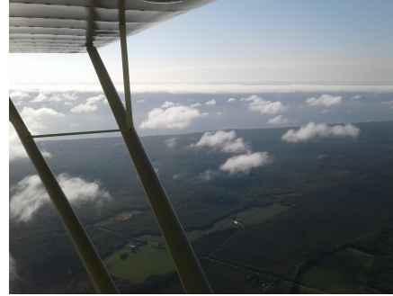
Upper Peninsula, MI

Had a good trip this month in my 1946 Aeronca Chief. Dad and I left Wedington Woods, and ended up in the Upper Peninsula, Michigan and back home. We landed at Blakesburg, IA for the AAA antique fly-in and Oshkosh, WI on the way up. On the way back, we landed at Brodhead, WI for the MAAC antique fly-in and Galesburg, IL for the National Stearman fly-in. Round trip was 25.5 hours and 1800 miles, all in a non-electric, hand-propped airplane.