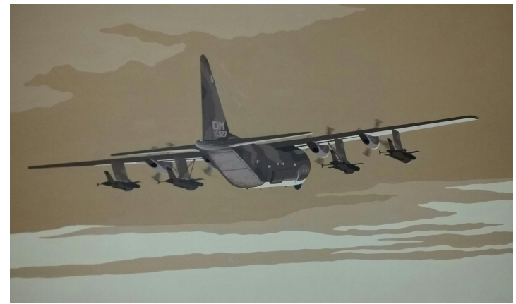
DC-130A. This aircraft was built in 1956. Drones were approximately 3,500 lbs. each and they either performed reconnaissance or electronic warfare missions.