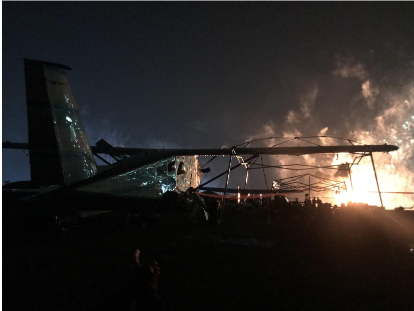
Oshkosh '21