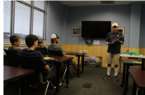
Young Eagle ground school.