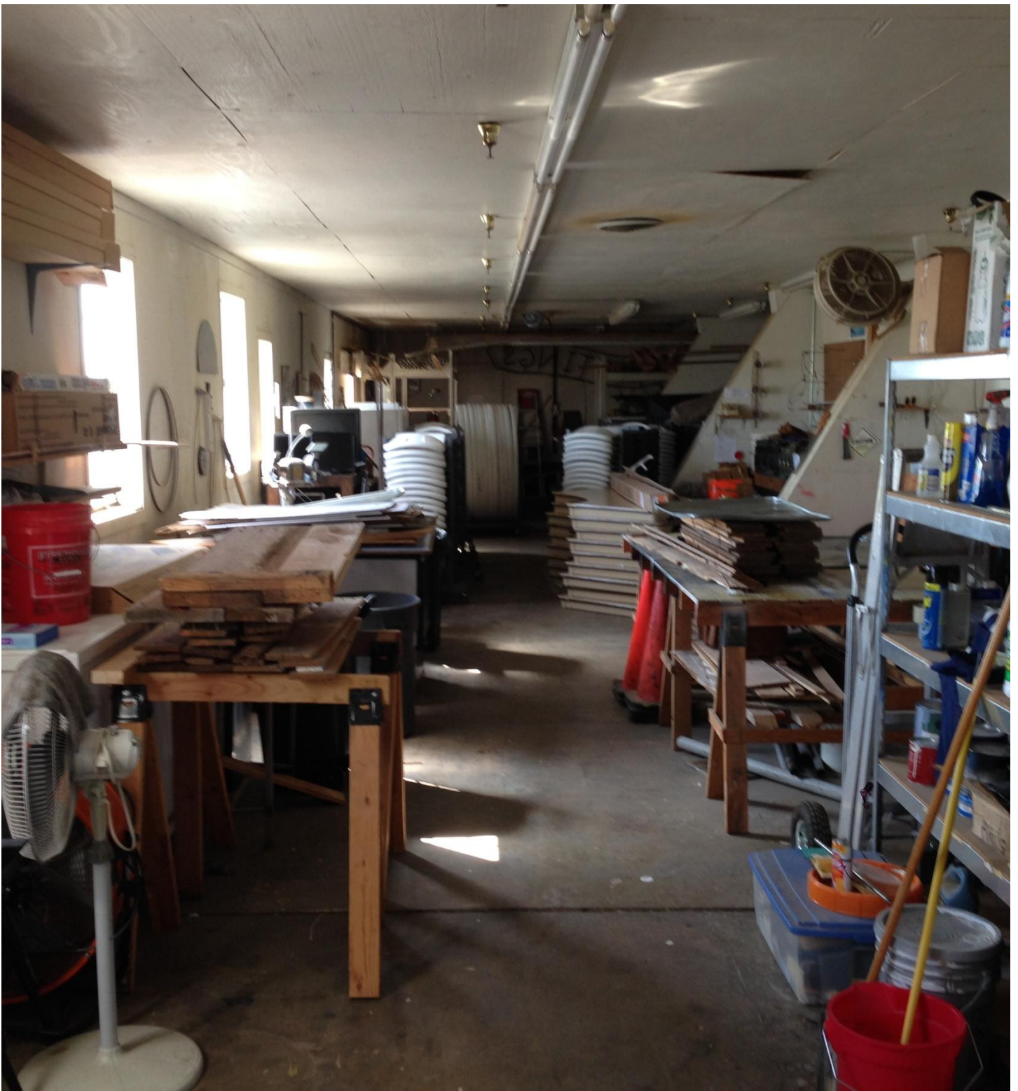
A view of the space the EAA Chapter will be allowed to use.