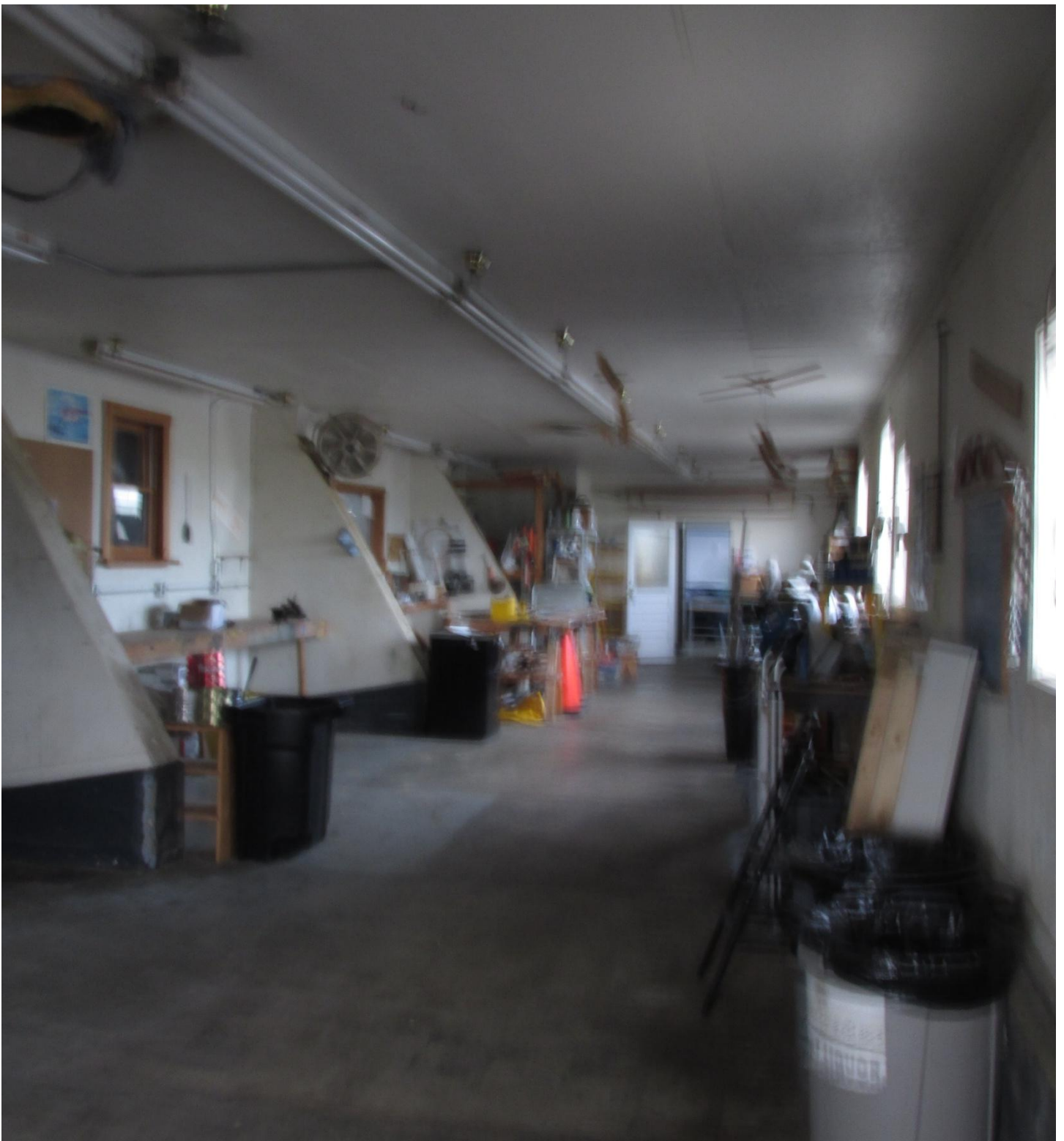
A picture taken after the work day at the Museum in Fayetteville. Great progress!!!