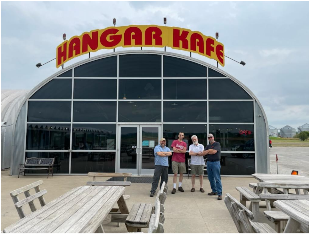
The Wedington group flew to Kingsley for breakfast (before it got too hot) on Saturday July 2nd.