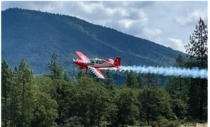
The day wouldn't be complete without Bear in his Extra 300.