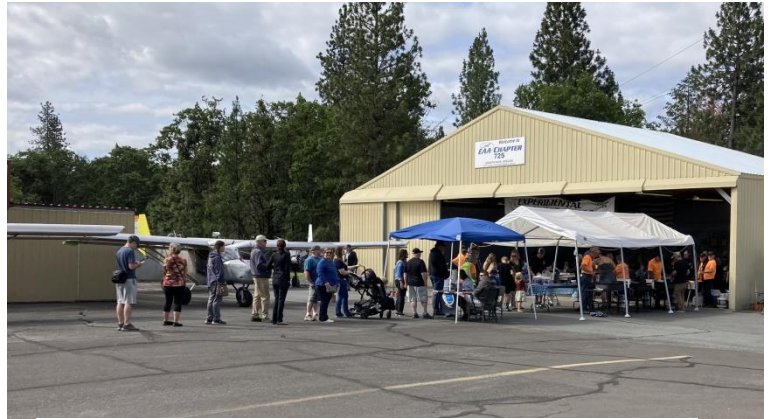
This photo was taken at 9:50, probably near the peak of our customer volume.