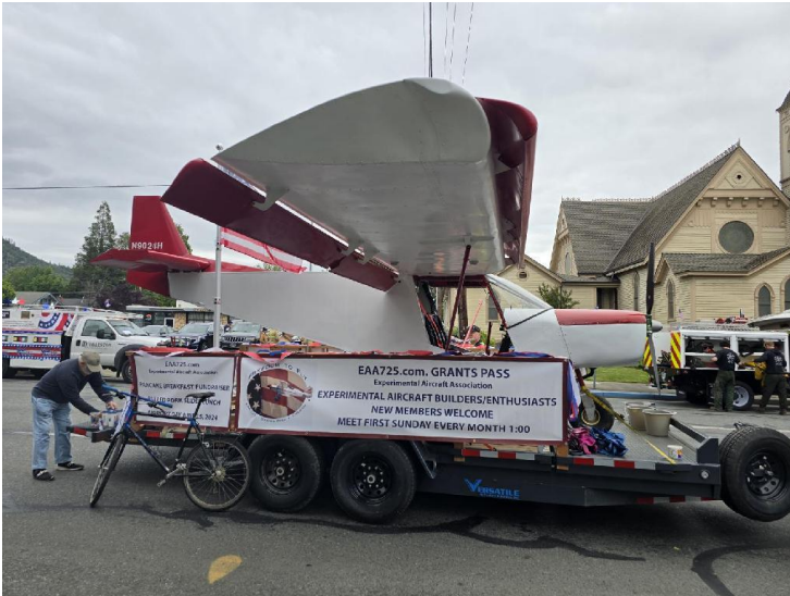
All ready to go. Let the fun begin.