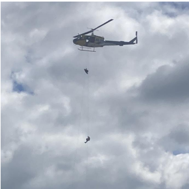
The Rappel Team put on an impressive demonstration. A real adrenalin rush, I'm sure but, during fire season, this is serious business.