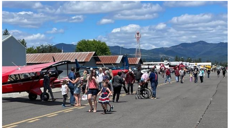
An overview of the crowd eyeballing the impressive lineup of aircraft on display. Temperature was in the 70's and beautiful puffy clouds dotted the sky. There were several local events competing for attendance, but we certainly got our share of the area's population.