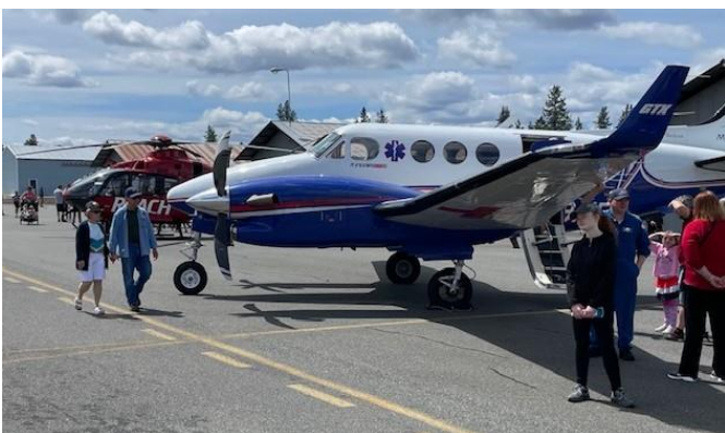
Mercy Flight's King Air was joined this year by the REACH Airbus H135 Medivac helicopter. REACH is part of the Global Medical Response family of companies. Cal-Ore Life Flight is a REACH affiliate.