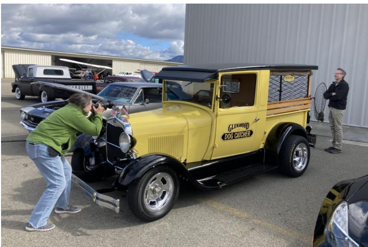
This dog catcher buggy was at the 2022 Airport Day event also. The sign on the side of the cage says Beware-Unhappy Hounds.