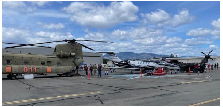
The Dutch Bros CJ4 and an Army Blackhawk helicopter completed the flight line display at the north end of the ramp.