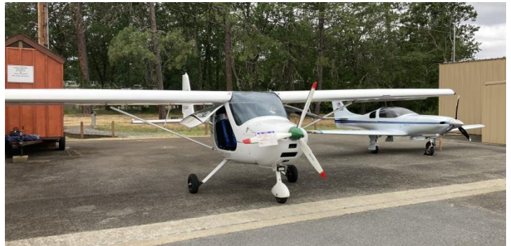
Eric Haskin's G3 600 and Allan Runia's Lancair 235 were parked alongside the hangar. A really good showing of members' airplanes.