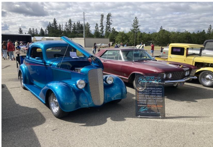
On to the cars. I've included just a few. This is a beautiful and extensively modified 1936 Chevy 5-window coupe owned by Ron and Kay Smith of Medford. I'm no expert on antique cars, but I don't think a 350 Chevy engine and mating transmission would have been a factory option in 1936.