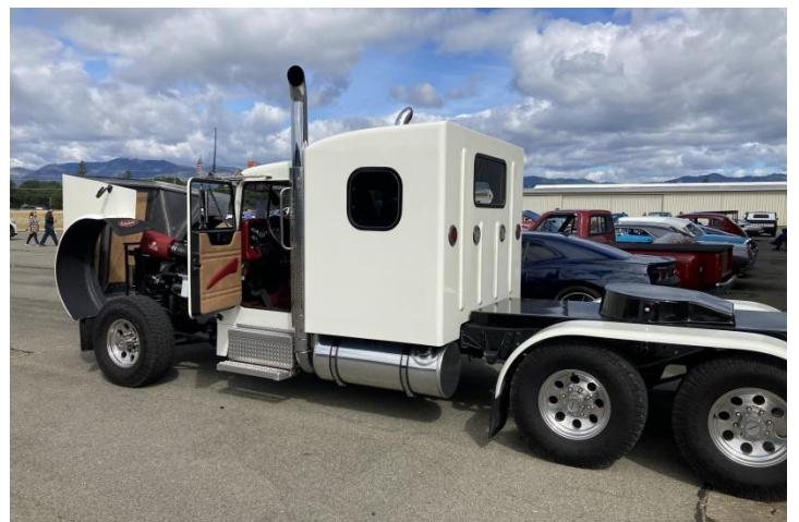
Another return, this Peterbilt Model 379 5/8 scale by Lil Big Rig. It has an all fiberglass body installed on a 1996 Ford F250 Extra Cab 7.3L diesel pick-up frame. All the comforts and features you would expect to find in your passenger car are in the cab. If I had spent more time, I might have even found the owner's name.