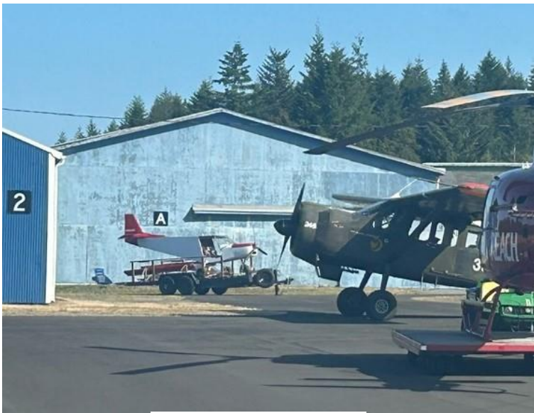
And here's proof.