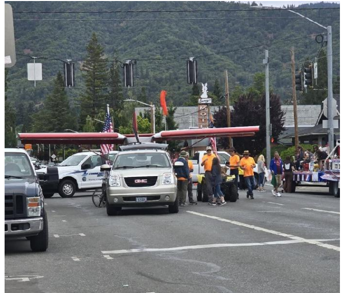
Head 'em up, move 'em out. We're on parade.