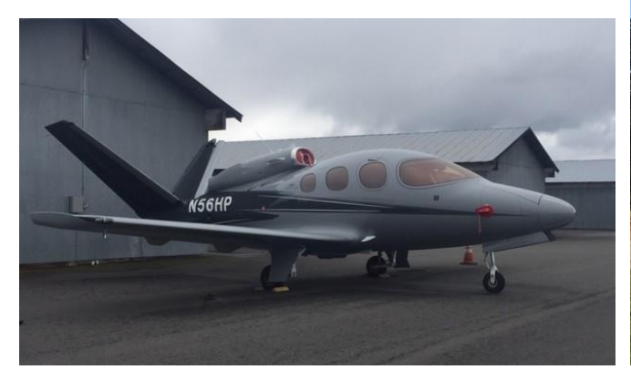
This little guy was a recent visitor and a somewhat unusual one at that. It's a Cirrus Vision Jet SF50, registered to Vision Aero LLC out of Ringgold, GA. Looks like Cirrus almost matched the hangar color.