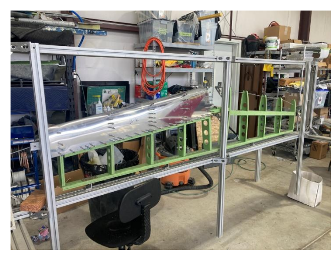
The stabilizer for a new Harmon Rocket is going together in its build fixture. No pre-punched holes here. Just lay out rivet patterns with very fine Sharpies and drill lots of #40 holes.