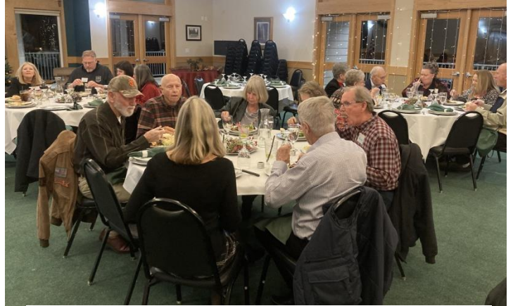
Another view of our members and guests enjoying the excellent buffet dinner. Sure quieted the conversation.