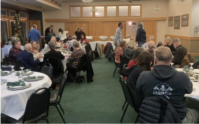
Dinner time. Thirty-six attendees and room for more. I don't see how we could find a better venue for our annual Christmas party.

Here are a few photos. Note to self: When photographing the gift recipients, make sure the wall lights are not in the picture.