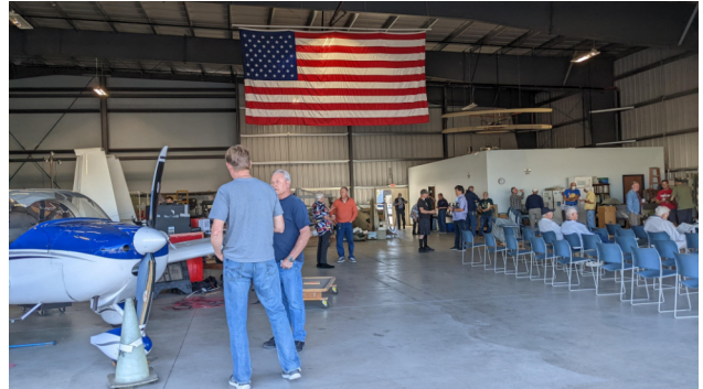
Below: Before the General Meeting