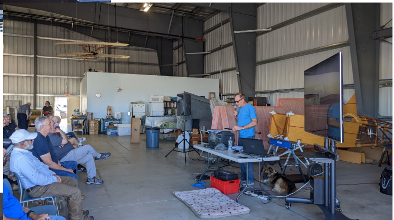
Below: Chapter Members and other February Meeting attendees listen to the presentation.