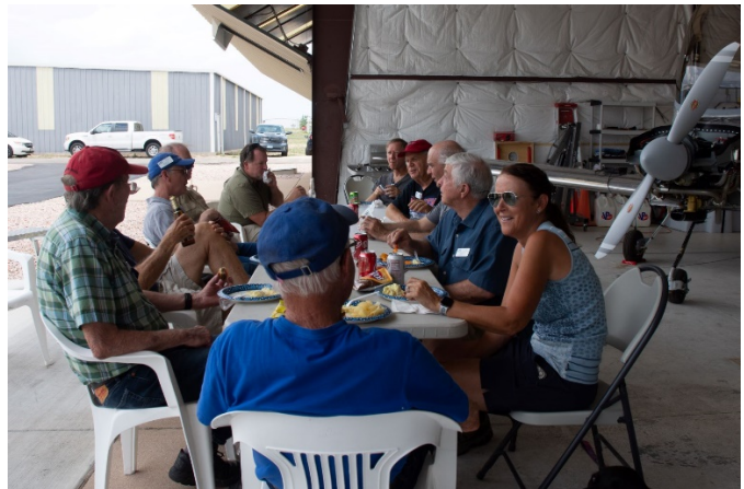
Project Tour BBQ