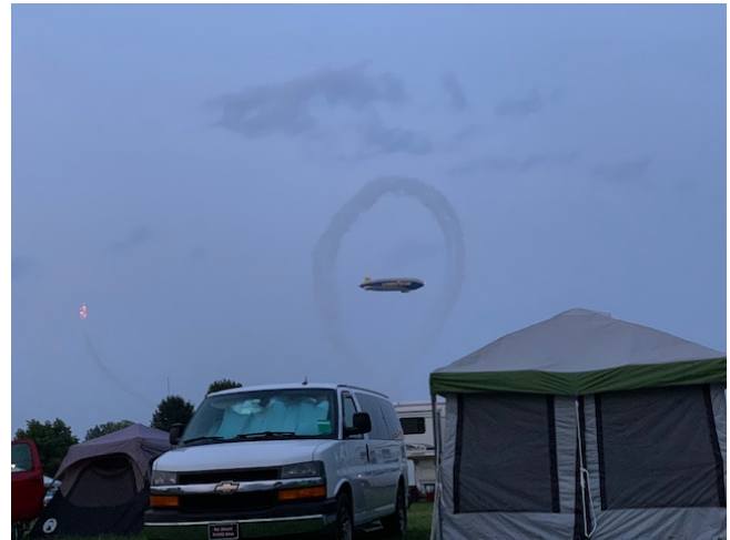
The Aeroshell T-6 aerobatic team opens the night airshow with the Goodyear blimp.