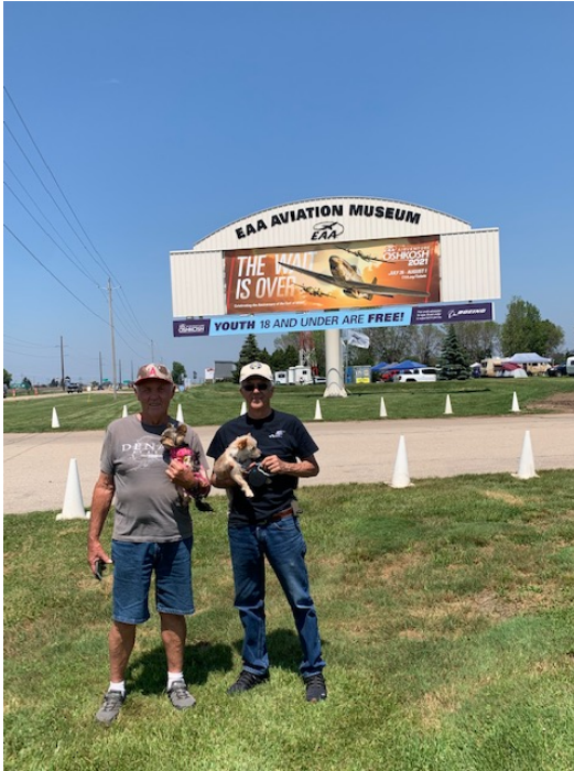
Youth under 18 free this year.