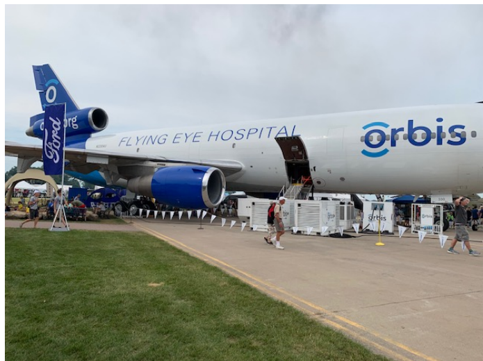
Project Orbis MD-10.