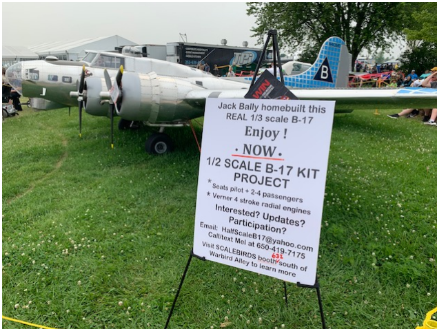
The Bally Bomber homebuilt.