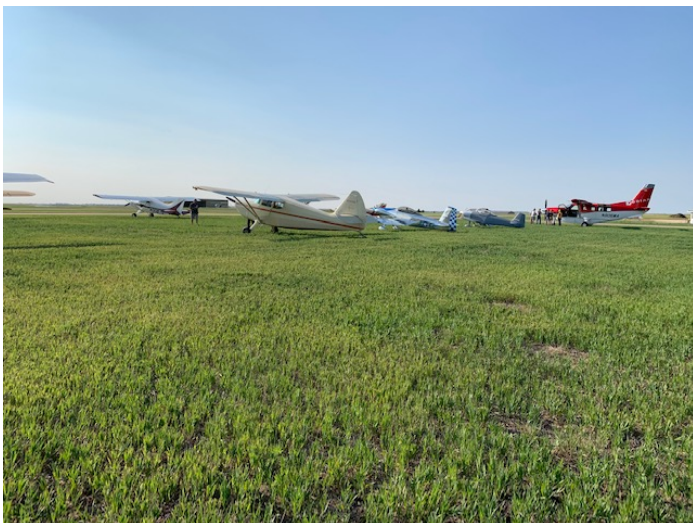
Many hungry pilots flew in.