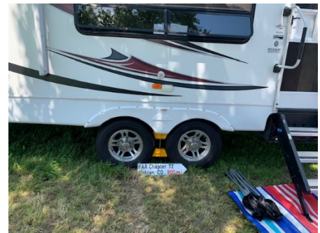
Chapter 72 campers