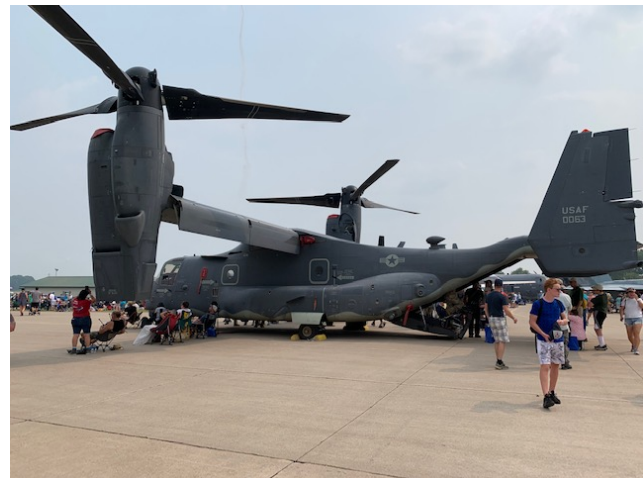
USAF Tiltrotor on display in Boeing Plaza.