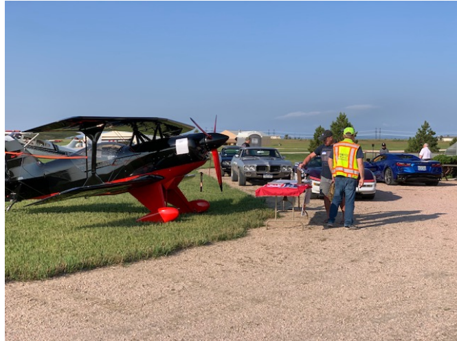
Jaimie Treat's Aerobatic Plane.