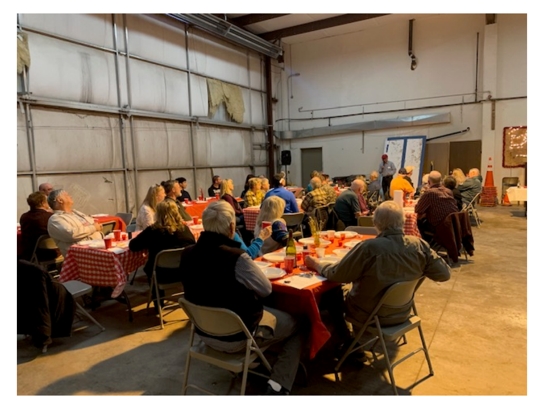
Mar. 2021 Meeting—Spaghetti & Chapter 72 Anniversary Dinner