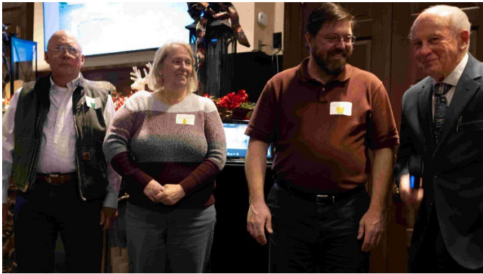
Chapter 72 Officers