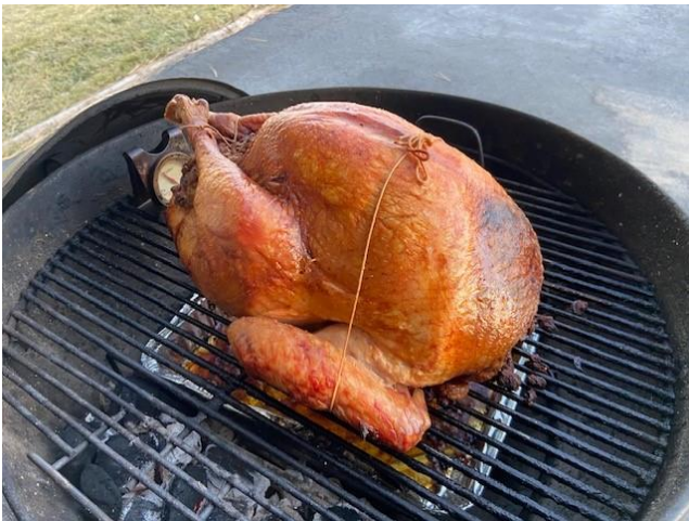
This is the way the turkey arrived.