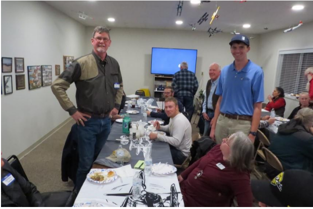
This is what happens when you're declared the tallest men in the room!