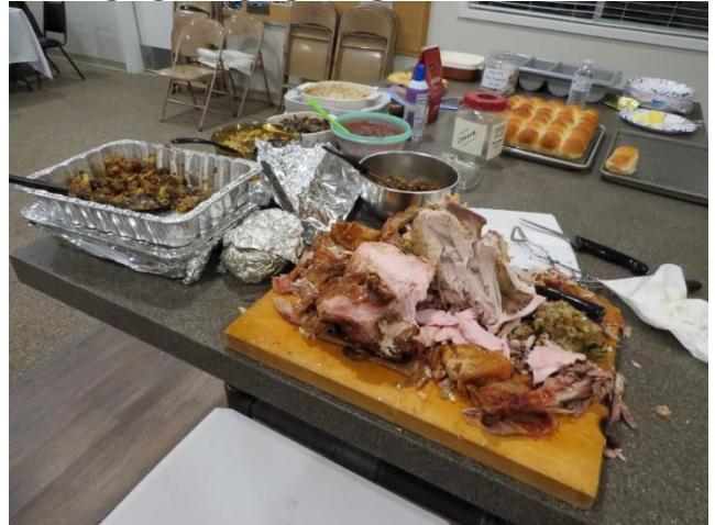
.....Gone! The turkey as the bird departed...not much left!