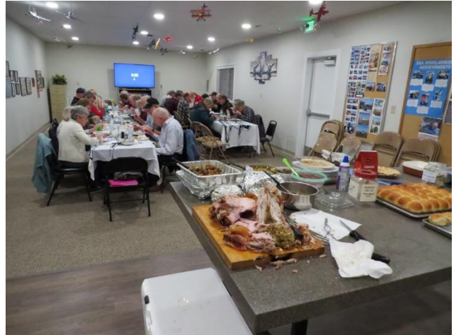
Going, going, going.....