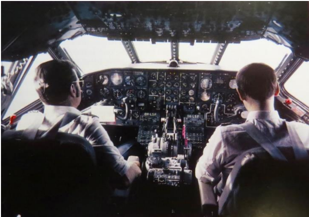
Answer: Sud Se-210 Caravelle.