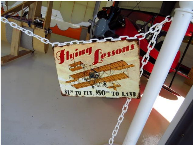
Jerry Wenger's glider display was fantastic – Beautiful workmanship!