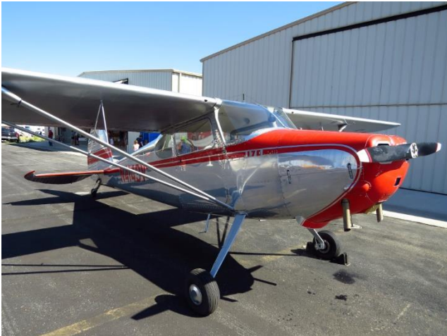
1948 Cessna 172...a big Cessna 120.