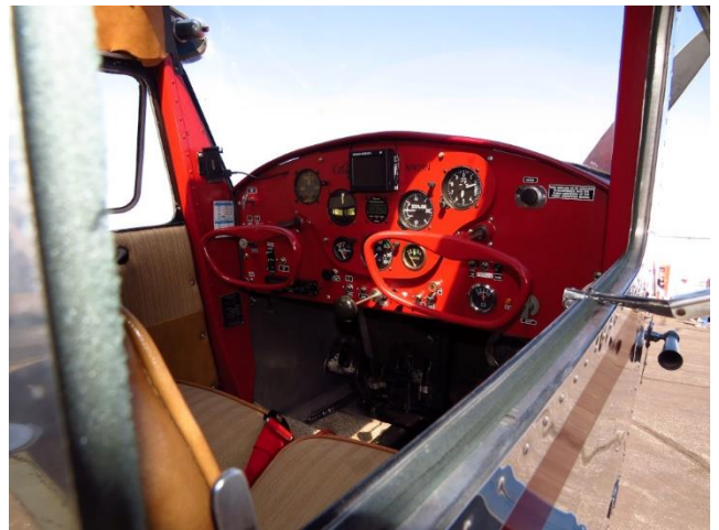
Beautiful Cessna 120 panel...no "glass" here, but it all works and gets the job done!