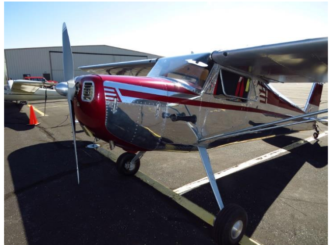
Cessna 120 ...a beautiful little bird!