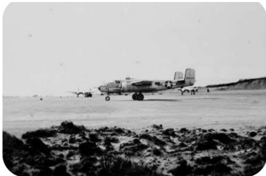
92 Aleutian Islands Campaign...