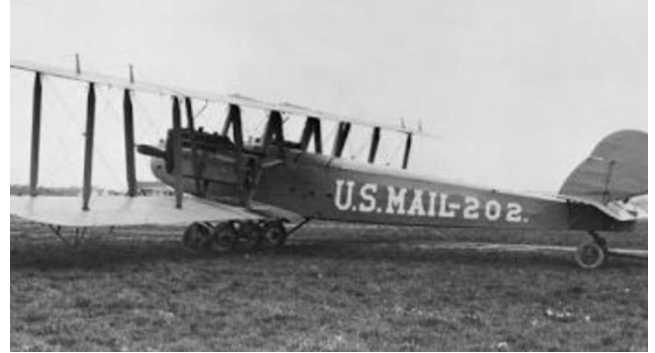
June 1919 Martin MB-1 Bomber mail plane