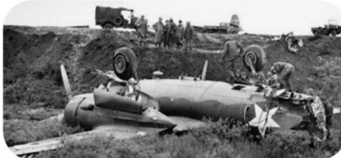
Aleutian aircraft of WW2

https://youtu.be/32s770Tmc9Q?si=r0GCz0vmw1KMqw4T