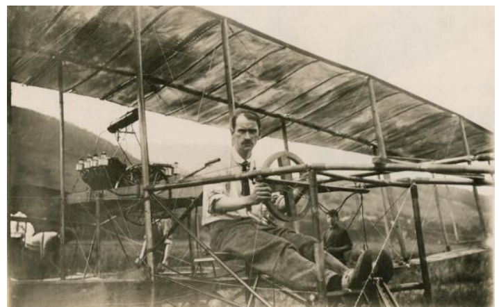
June 1911 Curtiss pusher Biplane

Next Board meeting: Wed June 18 at 8:30a