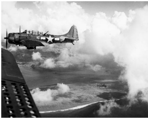
Dauntless Diver in the Battle of Saipan, June 1944