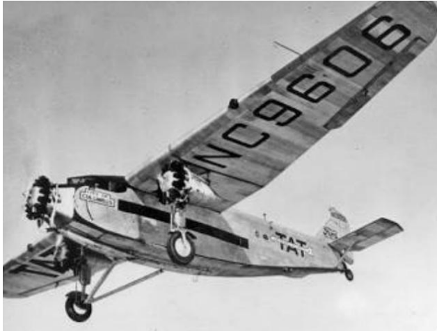
June 1926 Ford Tri-Motor "Tin Goose"