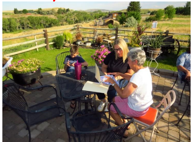
Beautiful Day for 'Smash Burgers'