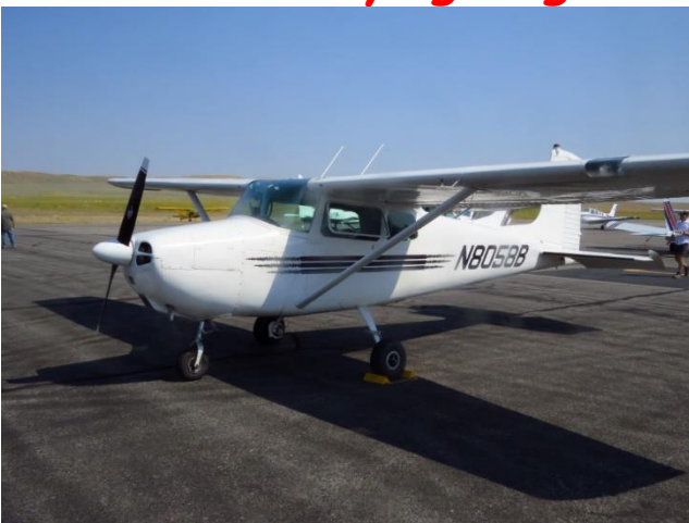
Fred's 172 ready to go!