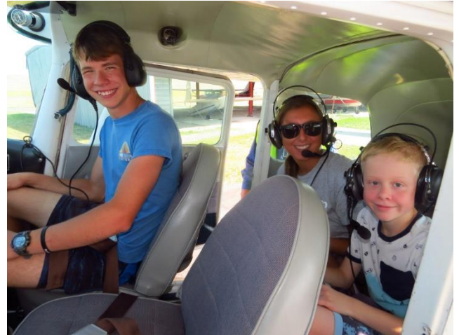
What it's all about!