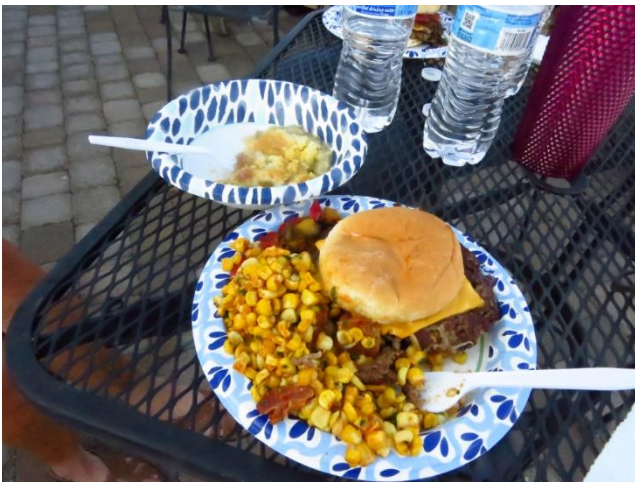
This was really quite a meal