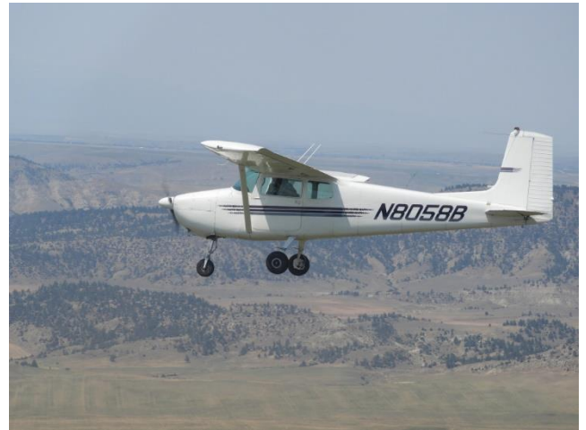
Fred's 172 enroute home!