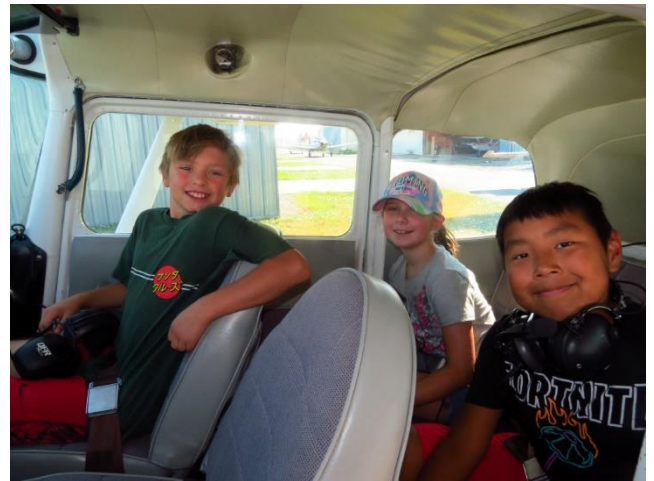
Happy Young Eagles