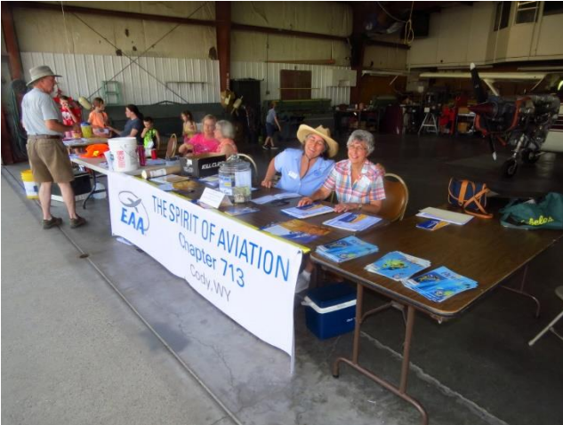
Young Eagle Ladies!