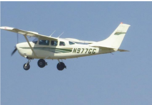
Perre's 206 Flying Eagles