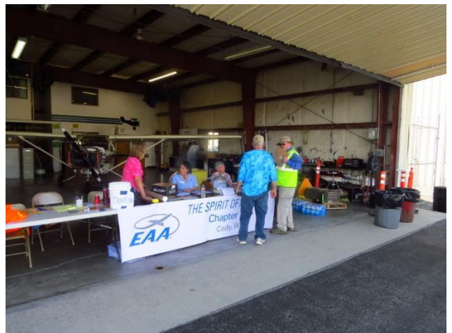
Setting things up