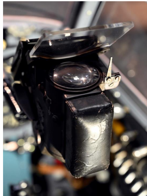
Revi C/12D gunsight