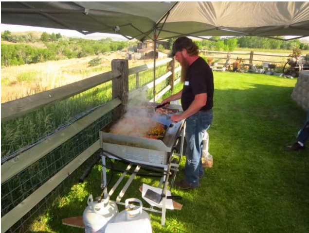
Our Chef at work!