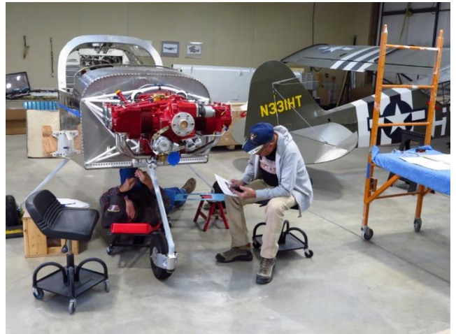
Hey, this is pretty complicated!