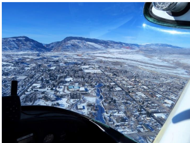
Downwind for KCOD runway 04!

Well, here it is October already...rather hard to believe, but judging by the colors it is happening...again.