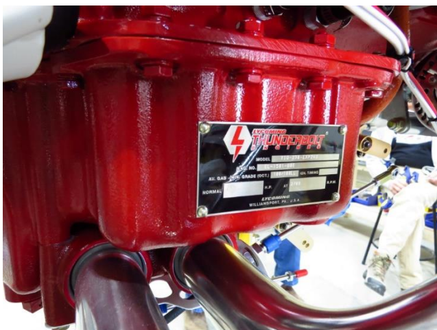
Engine data plate.