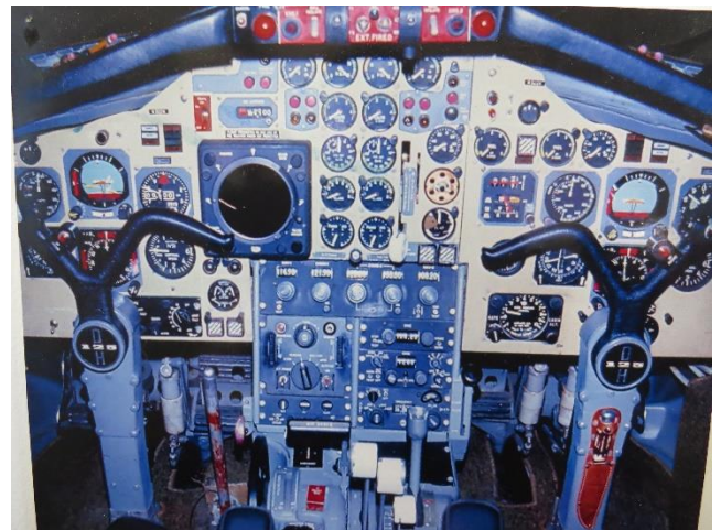
De Havilland DH-125

Remember: you can zoom in for more detail in pdf documents.