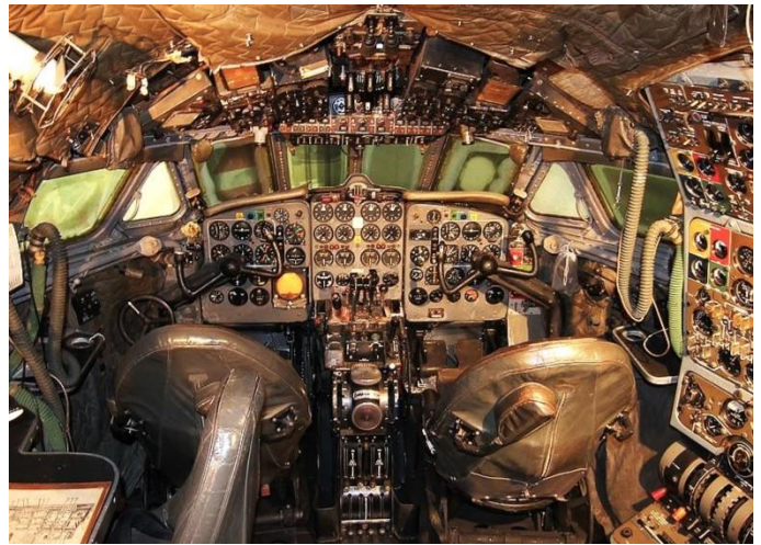
De Havilland DH-106 Comet

These cockpit photos are in themselves very interesting (I think). Cockpit ergonomics, as they say, was in its infancy. Many critical controls and instruments were scattered all over the place. The Comet cockpit was managed by 4 crew members. Two Pilots, a Flight Engineer, and a Navigator/Radio Operator.