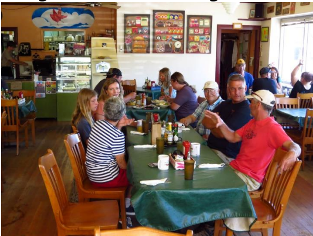
Lots of tall tails