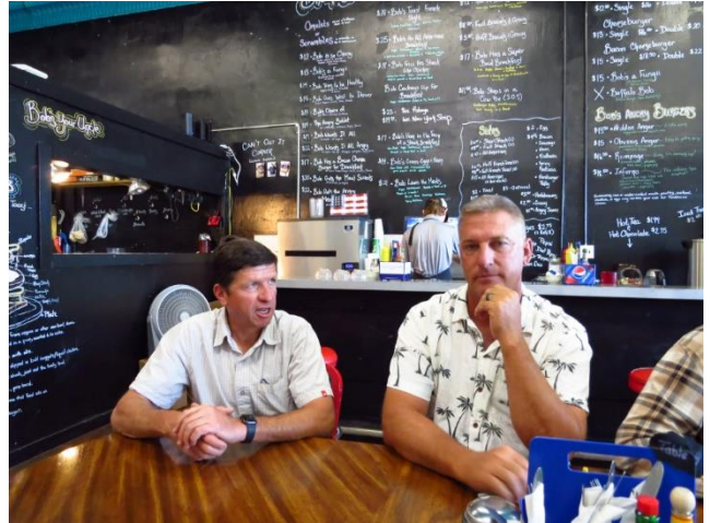
Some serious conversation took place