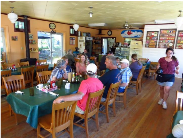
Regis Café and some good food