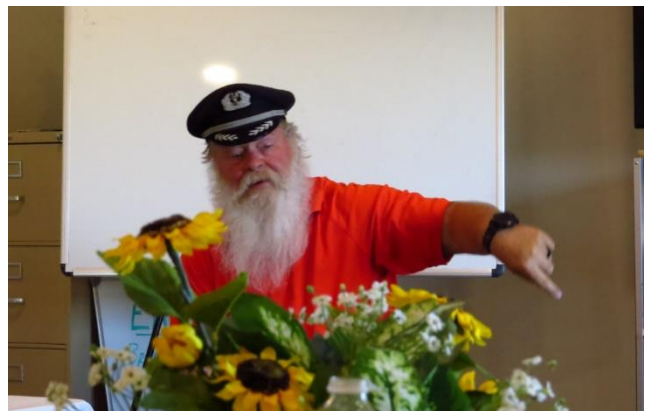
We're approaching this in a professional manner! So listen up!