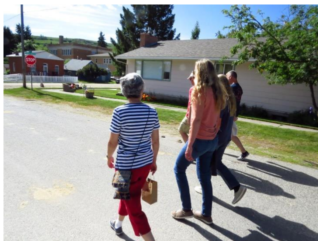
The Red Lodge walk