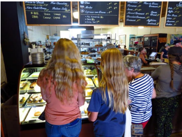
A little shopping at the local bakery