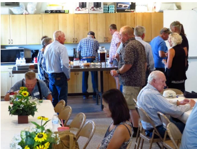
Serious eating going on here