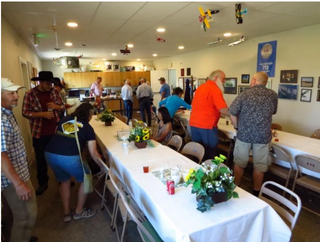
Dinner is served!