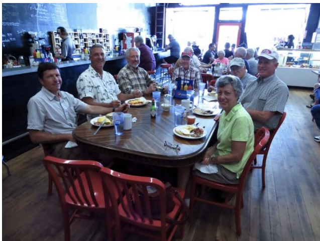
Everybody looks happy

That's all folks! Come to the meeting and enjoy the burgers and hot dogs/brats...and an interesting presentation.