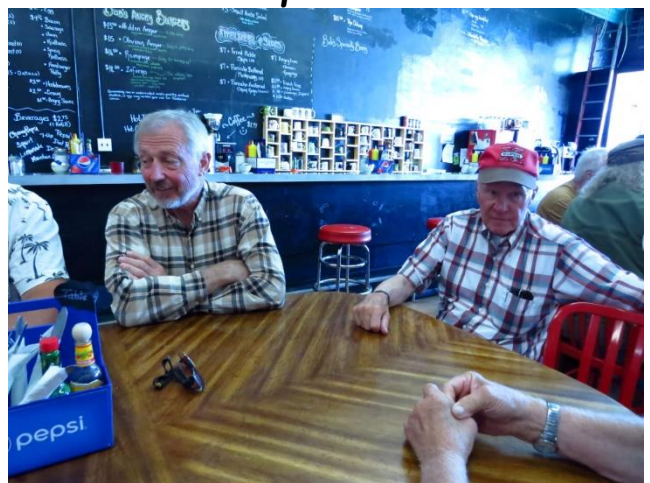
Bob's Diner and Bakery...good food and the menu is on the wall!