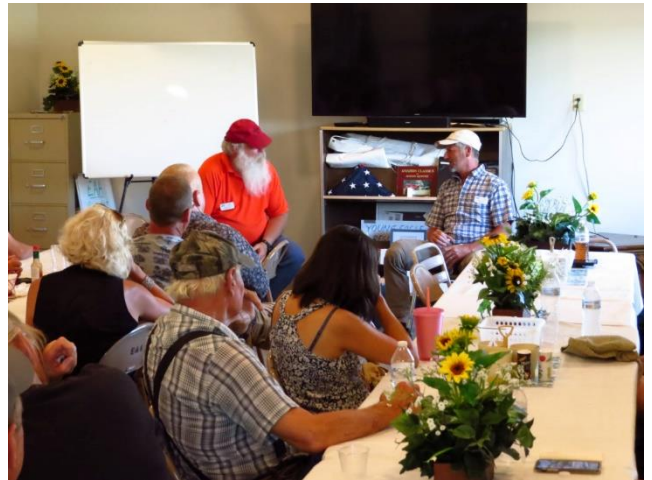
The student and instructor meet... "He looks reasonably bright."