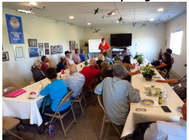
This guy was a challenge!