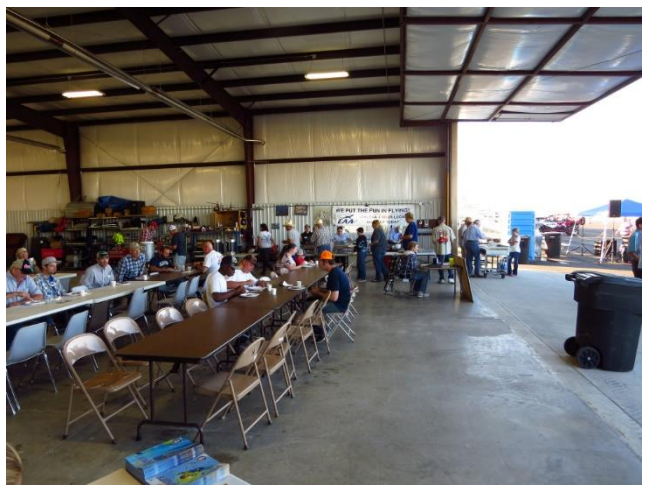
Happy Pancake Eaters!