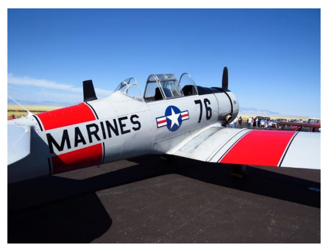
WWII Era SNJ/AT-6 Trainer!