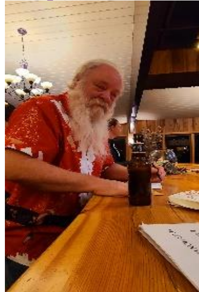
Casual Santa at the Bar!