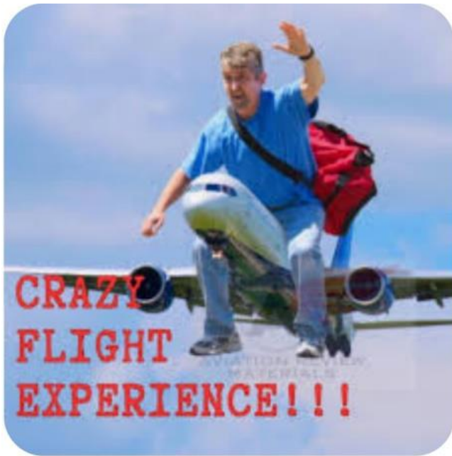
Photo requests from the Newsletter Editor