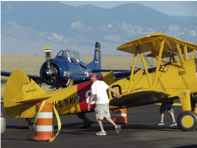
Wings and Wheels