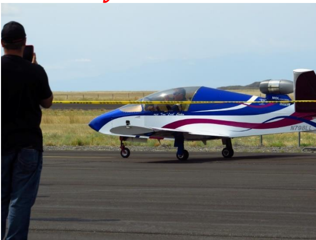
Mini-Jet! At Wings and Wheels