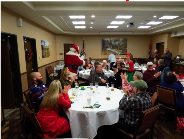
Santa and His Elf Visit ...