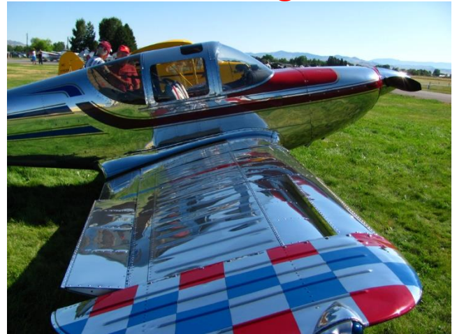
Swift at Three Forks