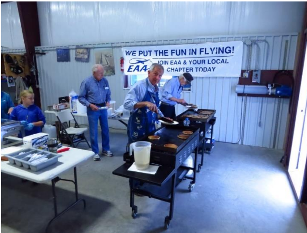
Karl Flippin' Pancakes