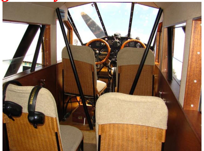
Travel Air at Three Forks