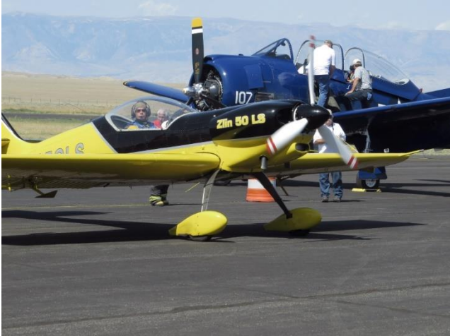
Wings and Wheels