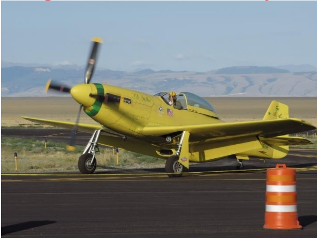
Bob Hoover's P-51