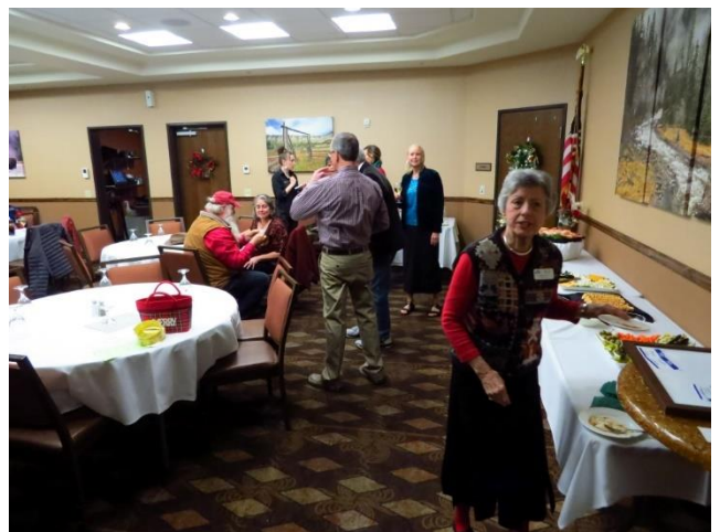
Christmas Buffet Dinner - getting things started.