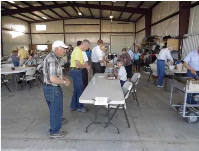
Another Breakfast Event