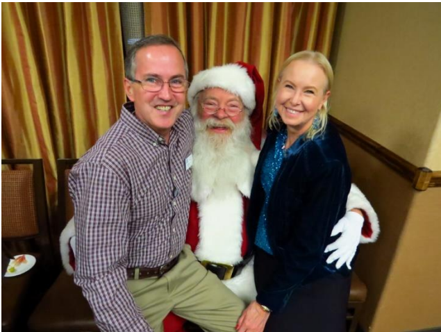
Merry Christmas Friends