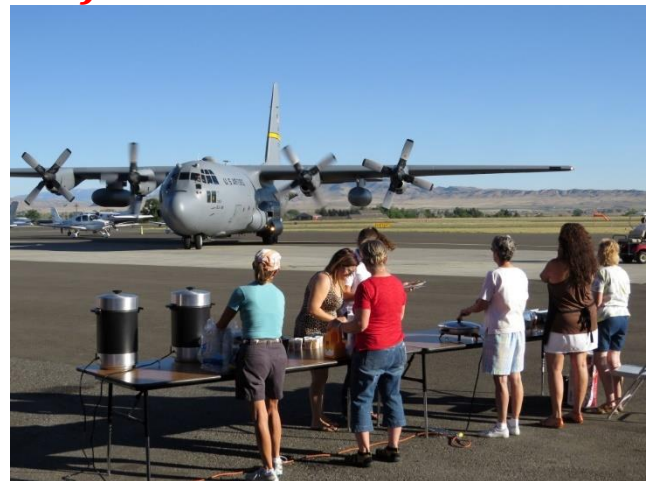
WY ANG Visits Choice AirFair as Breakfast Crew sets up for the crowd – Volunteers!