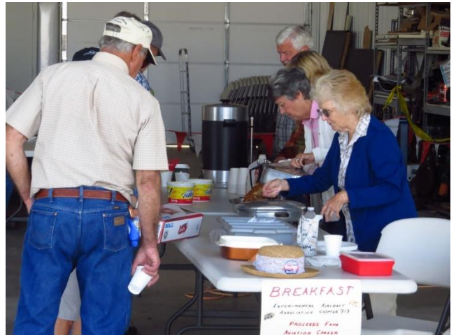
Breakfast Work Crew