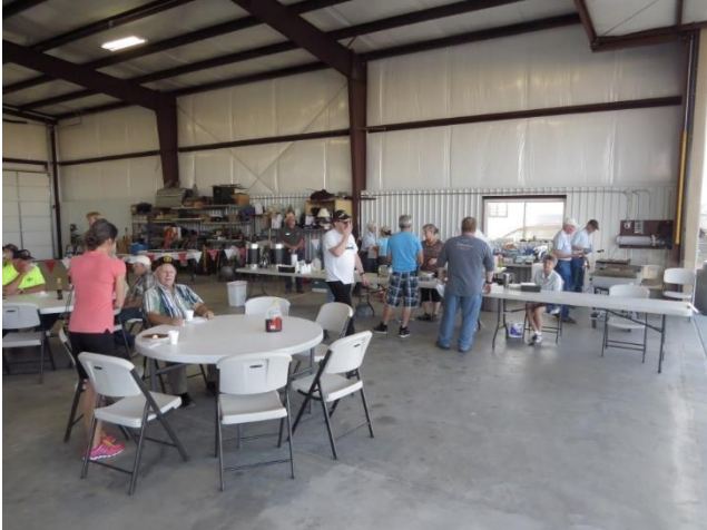
Wings and Wheels Breakfast