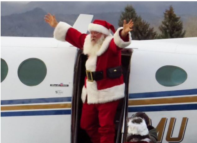
Santa Arrives In Cody