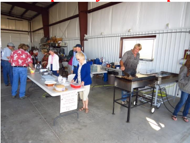
Wings and Wheels Bfst Crew