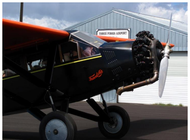
Three Forks, MT