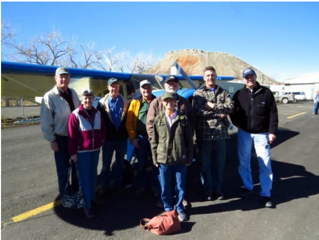
Thermopolis Fly-Out Group