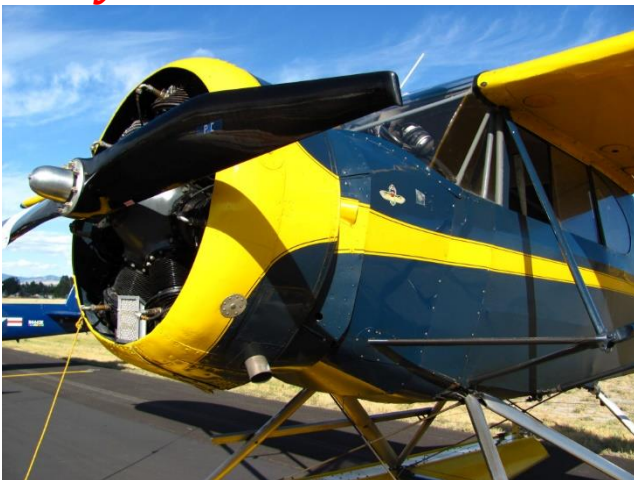
Faust Utility Aircraft