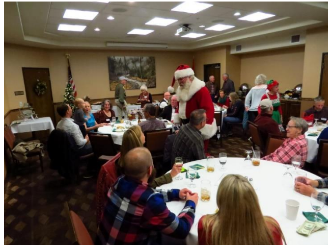
...EAA 713 Christmas Dinner Party!