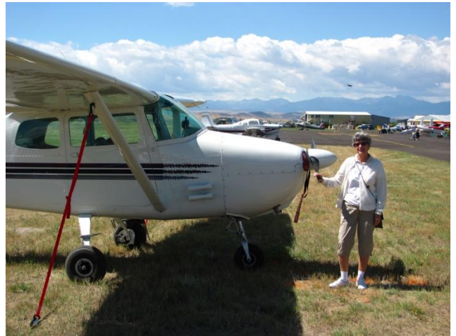
Cebe Sue at Three Forks - A great Fly-In!