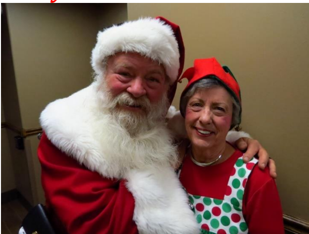
Santa and His Elf - Ho! Ho! Ho!