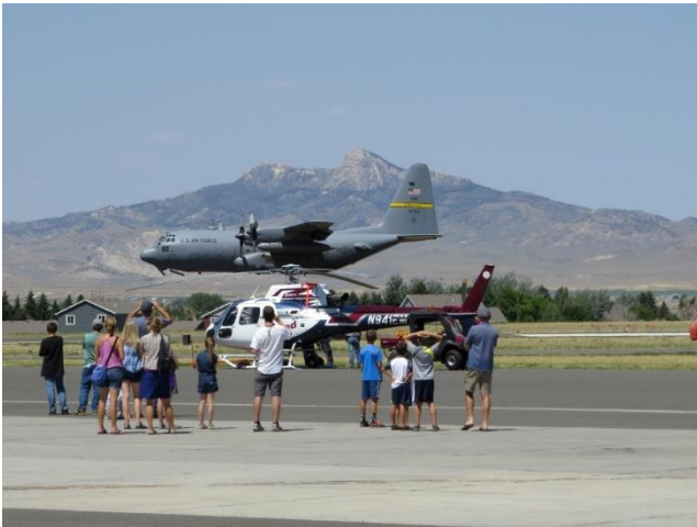
WY ANG C-130 Low Pass