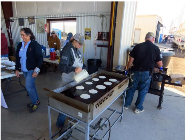
Pancake and Sausage Flippers