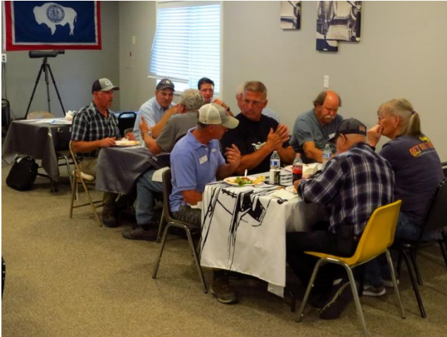
THE PRESENTATION BEGINS!