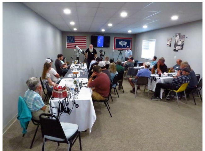
EVERYBODY ENJOYING THE MEAL AND FELLOWSHIP!