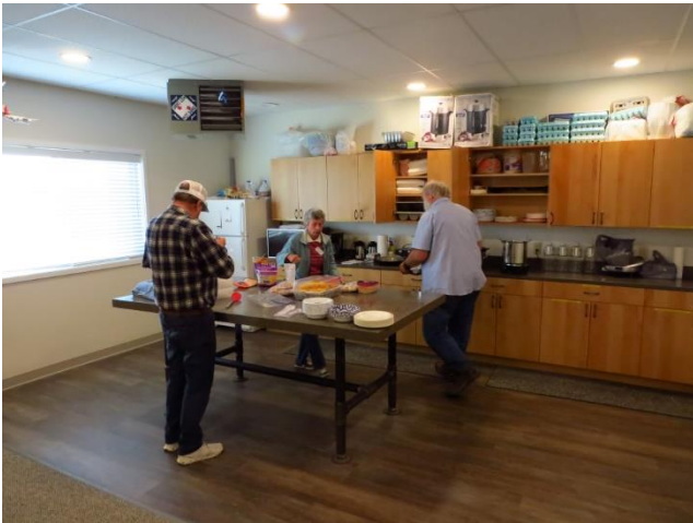
The food being set-up for the gang!