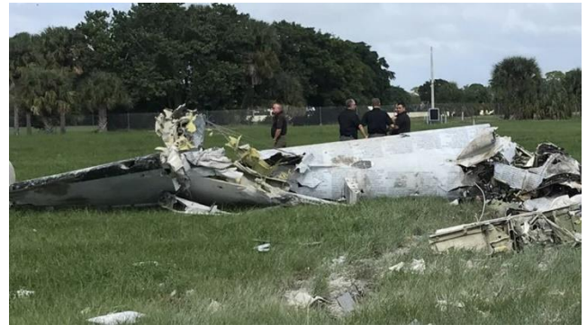
Photo of fatal 2019 crash at Stuart Air Show in Florida via the internet.