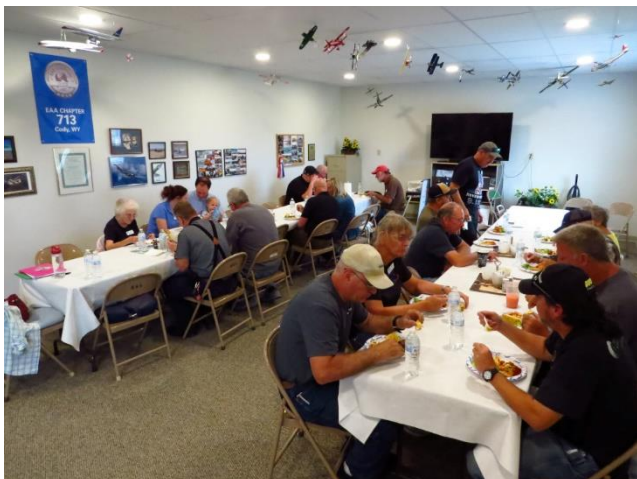
Everyone clearly enjoying the food!