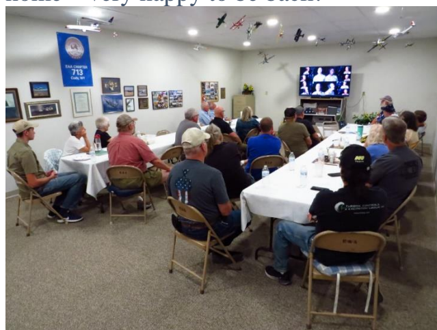
The program ended with a patriotic song.