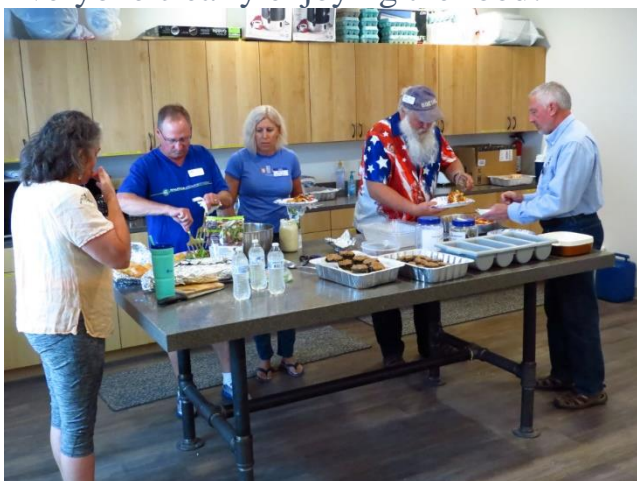
Outstanding pasta and salad!