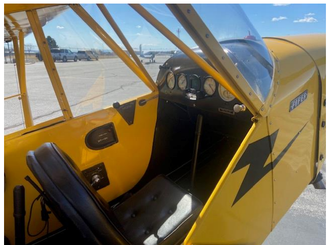
Beautiful Piper J-3.