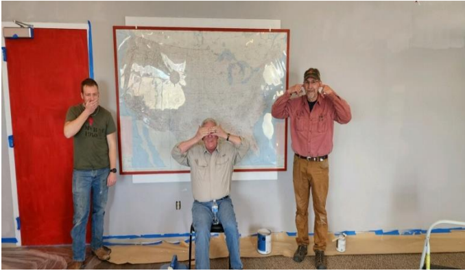
Let's see: Say nothing, See nothing, Hear nothing! I think these guys have got this figured out!