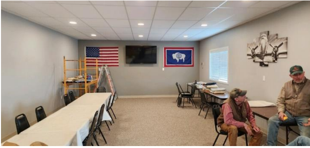
The Finished Product – Outstanding!

Cebe and I flew into Laurel last week for a little Costco outing and these beautiful little classic lightplane tail-draggers were sitting there on the ramp, with their pilots gathered together talking – probably about the beautiful flying weather. Take a look: