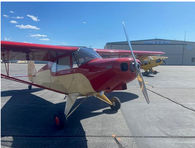
Piper Super Cruiser.

Cebe and I flew into Laurel last week for a little Costco outing and these beautiful little classic lightplane tail-draggers were sitting there on the ramp, with their pilots gathered together talking – probably about the beautiful flying weather. Take a look: