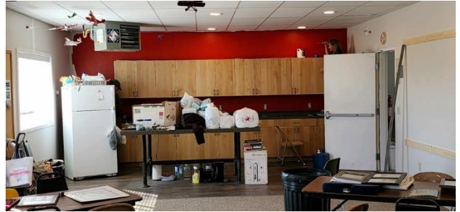
After paint – Nice job!