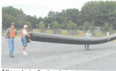
Attempts to fly the Solar Balloon were not so successful - due to the overcast skies.