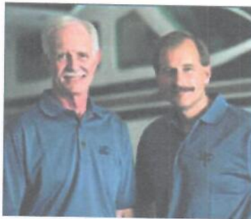
Changing of the Guard - New Young Eagles Co-Chairs.