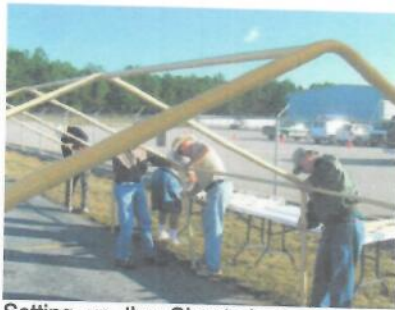
Setting up the Chapter's tents near the Landmark FBO on the north side of the airport was well organized.