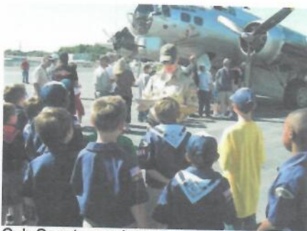
Cub Scouts receive a pre-tour briefing.