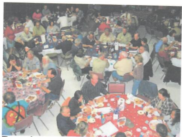
The now famous and very popular "Low Country Boil" was enjoyed by a packed hangar full of attendees.