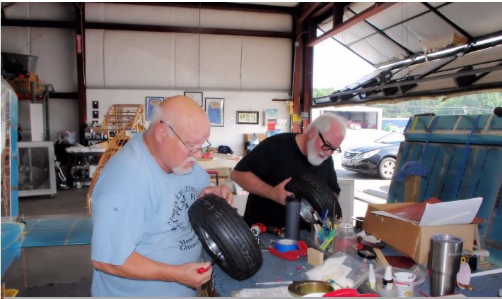
The wheel halves get torqued before being placed on the axle.