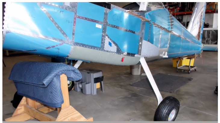
It's on the main gear. Don't ask how we struggled with the cotter pins - a simple task.