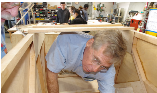
Frank, it's easier to get into the cockpit in the normal manner well, maybe not