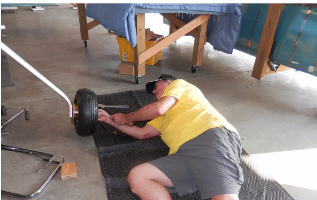
Getting the cotter pin in turned out to be a struggle, at first!