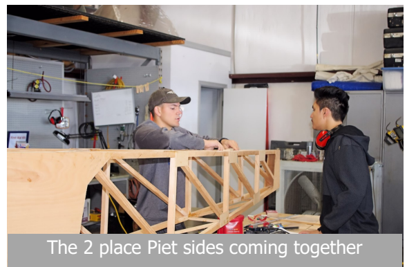
The 2 place Piet sides coming together