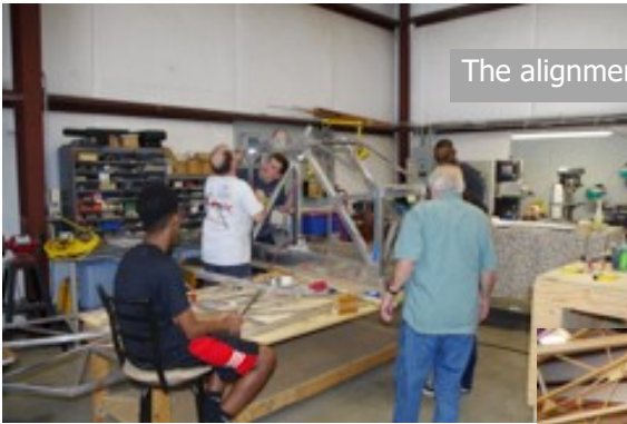
The alignment of the BD-6 fuselage sides have to be exact