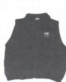
Fleece Vests $40.00

Chapter members Rick & Michele Gullet have promised prompt delivery of these items. Samples are available to look at in the AeroShoppe. Orders placed at the Pancake Breakfast will be ready for pick-up at the next Friday night meeting. Names can be added for $6.00. Great gift ideas – and Fathers Day is coming!