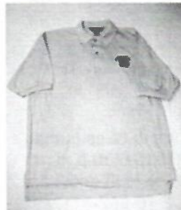
Polo Shirts $37.00