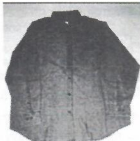
L/S Denim Shirts $35.00