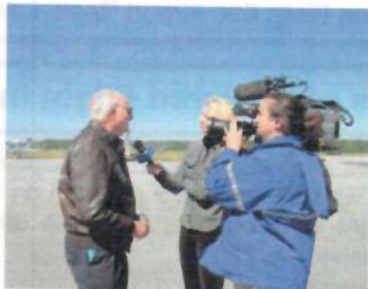
Media Flights & Interviews