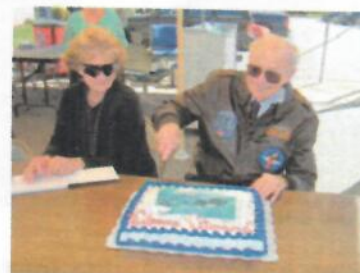
Sign the Guest Book & Cut the Cake