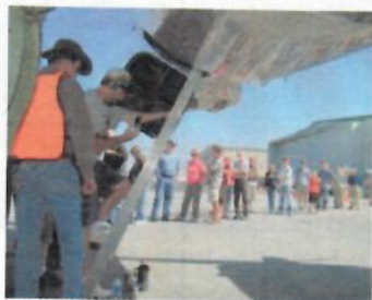
Crowd Ques to Tour the B-17