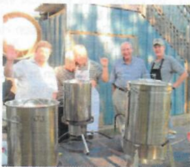
Kitchen Crew Gets Ready to Cook

Kitchen Crew Gets Ready to Prep for "The Boil." →