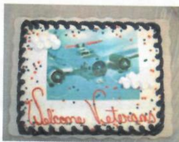
A Sweet Reception for the Vets