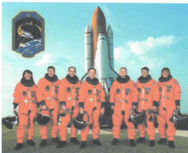
The Crew of STS-126 in front of Endeavour.

www.nasa.gov/mission_pages/shuttle/main/index.html . If you have access, you can watch live video of the training on NASA TV or directly from the NASA.gov web site.