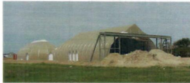
Photo of late stages of construction of Pavilion.

Festivities were held to celebrate the First Flight Centennial Pavilion ribbon-cutting on Wednesday, May 21 at the Wright Brothers National Memorial.