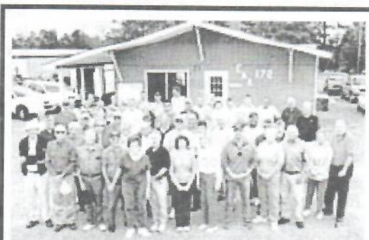
EAA Chapter 172 members stand in front of their clubhouse in a photo taken before vandals defaced it on January 28.

Pea Patch Airport is a private facility owned by a group of about 20 people, she said. The Augusta Chronicle, which reported the story, said airport owners have established a reward for information leading to the arrest and conviction of whoever is responsible for the crime.