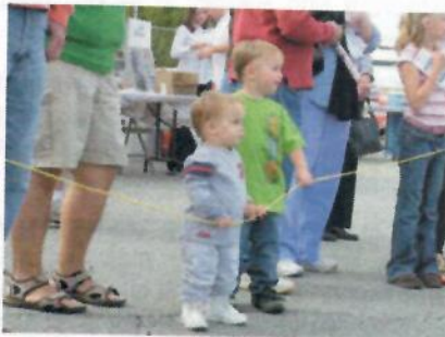
▲ Even the youngsters were enthralled by the majestic B-17.

Several Chapter 690 members helped to clean the B-17 while the mechanics repaired the broken cylinder. ►