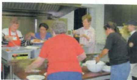
▲ The "Low Country Boil" is served by a very efficient kitchen crew.