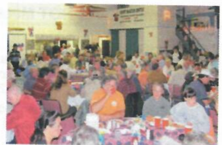
◀ ▲ A sellout crowd enjoys the delicious "Boil."