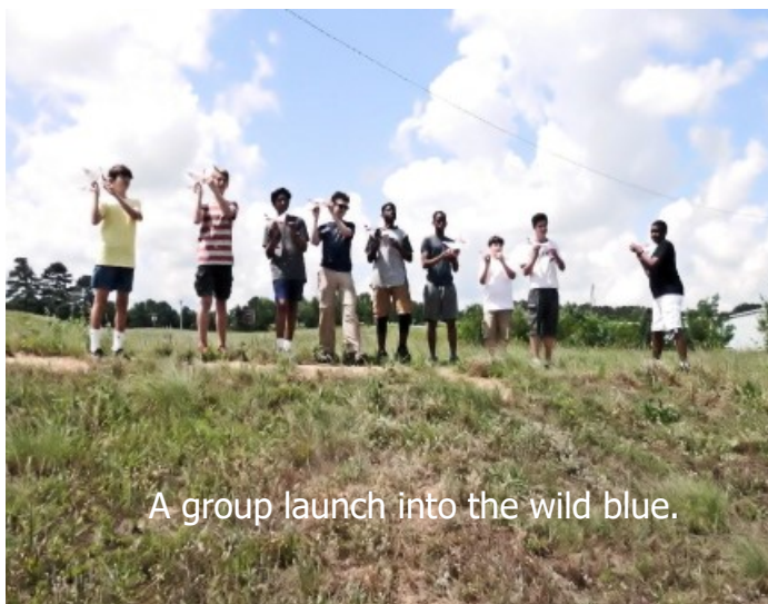
A group launch into the wild blue.