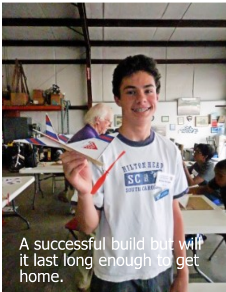
A successful build but will it last long enough to get home.