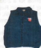
Fleece Vests $40.00