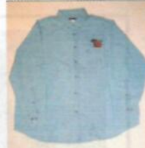
L/S Denim Shirts $35.00