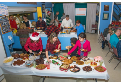
Desserts got a lot of attention