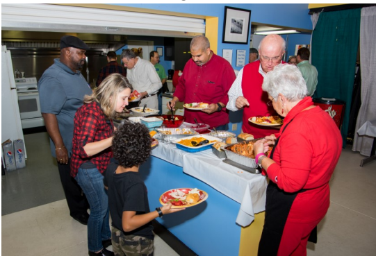
Lots of good food