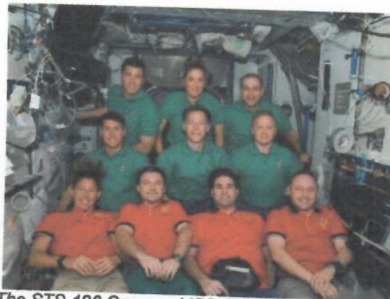
The STS-126 Crew and ISS Crew