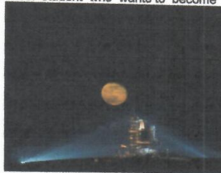
A beautiful full moon over Endeavour just before liftoff.

When asked what he would tell a high school student who wants to become