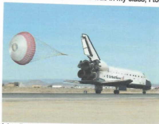
A landing to be proud of...