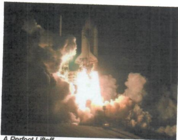
A Perfect Liftoff