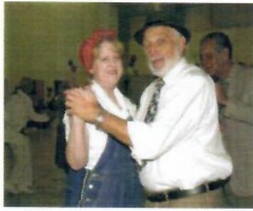
↑ Costume prize winner "Rosie the Riveter" takes a turn on the dance floor.