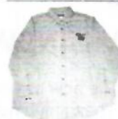
L/S Denim Shirts $35.00