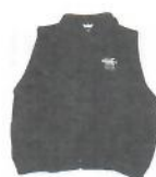
Fleece Vests $40.00