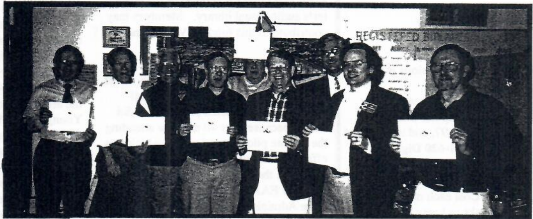
Chapter 690 recipients of the Young Eagle Achievement Awards for 1997