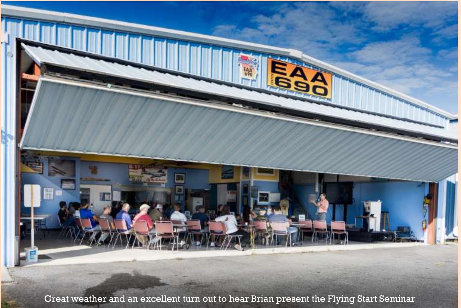
Great weather and an excellent turn out to hear Brian present the Flying Start Seminar

Brian spent $100 on advertising (Facebook) and had 3 attendees say they found out about the event via Facebook. The other forms of advertising used were direct emails, mostly to the parent's of Young Eagles who indicated they would like to go on an Eagle flight, and word of mouth.