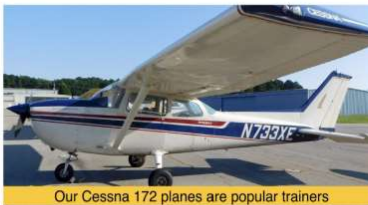
Our Cessna 172 planes are popular trainers

Founded in 2012 at Gwinnett County airport (LZU), the club now has over 60 members of all ages and backgrounds — from student pilots to certified flight instructors — to those who simply enjoy flying.