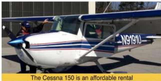
The Cessna 150 is an affordable rental

For more information on AeroVentures Club membership: