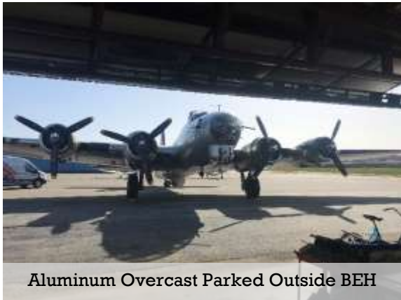
Aluminum Overcast Parked Outside BEH