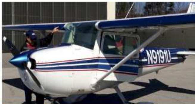
The Cessna 150 is an affordable rental

For more information on AeroVentures Club membership: