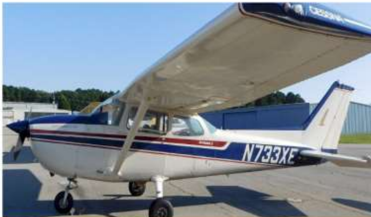
Our Cessna 172 planes are popular trainers

Founded in 2012 at Gwinnett County airport (LZU), the club now has over 60 members of all ages and backgrounds — from student pilots to certified flight instructors — to those who simply enjoy flying.