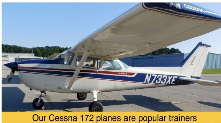
Our Cessna 172 planes are popular trainers

Founded in 2012 at Gwinnett County airport (LZU), the club now has over 60 members of all ages and backgrounds — from student pilots to certified flight instructors — to those who simply enjoy flying.