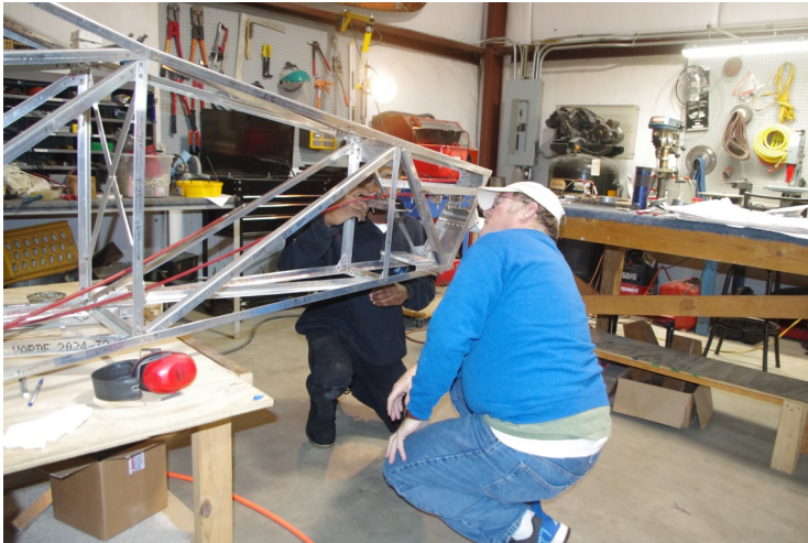
The new stabilator for the BD-6 has been received and is in process of being mounted.