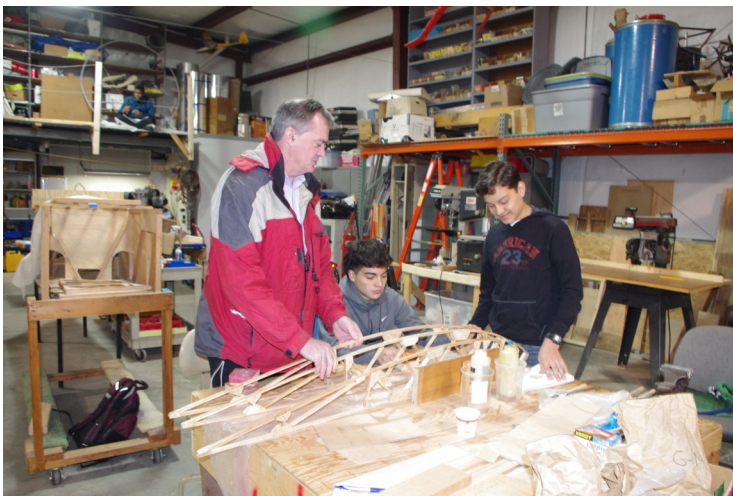
The guys are prepping the ribs for the 2-place Piet center section