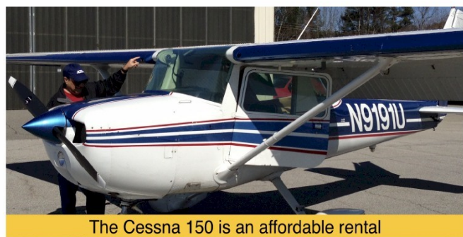
The Cessna 150 is an affordable rental

For more information on AeroVentures Club membership: