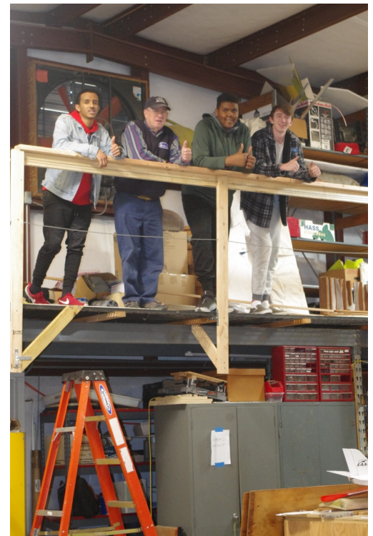
During the months when work could not go forward the guys on the project completed the loft safety fence