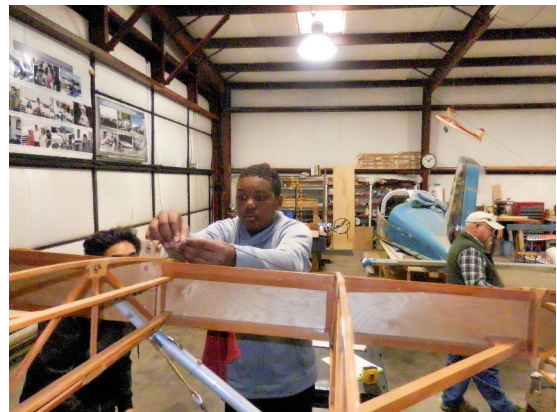
Feeding the aileron cable around the guide pulley on top of the Piet wing.