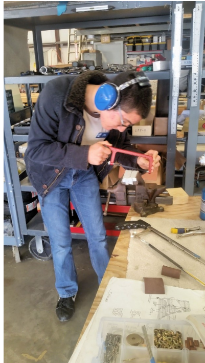
Learning to get a good square cut with a hacksaw takes practice