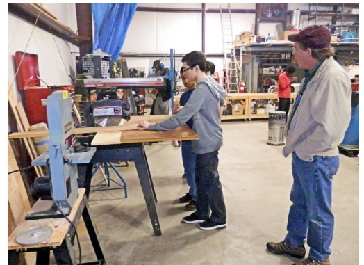
The radial arm saw is a new experience.