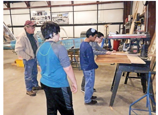
Learning to use the radial arm saw, with supervision!