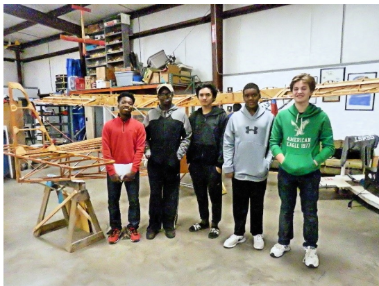
The "Piet Gang" at the end of the build session where they mounted the tail feathers.