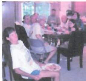
Spaghetti Bash is a tradition at the Epsilon Alpha Alpha House.