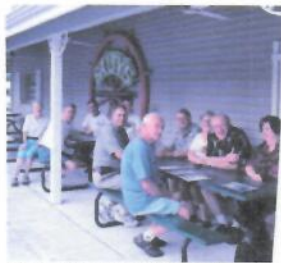
Relaxing while waiting for a table at Salty's Fish House.