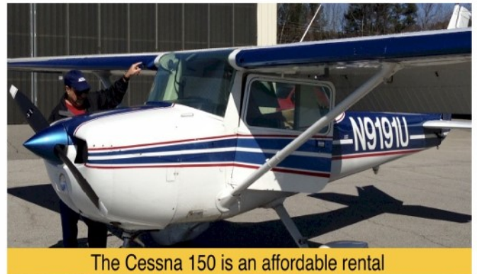
The Cessna 150 is an affordable rental

For more information on AeroVentures Club membership: