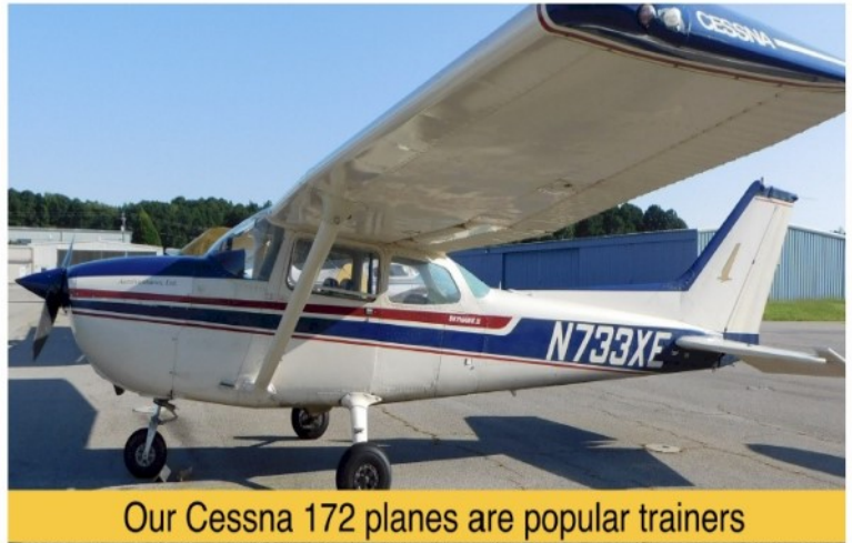
Our Cessna 172 planes are popular trainers

Founded in 2012 at Gwinnett County airport (LZU), the club now has over 60 members of all ages and backgrounds — from student pilots to certified flight instructors — to those who simply enjoy flying.