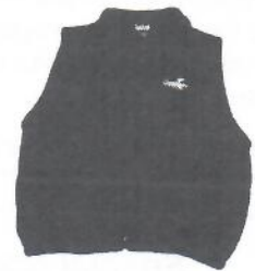
Fleece Vests $40.00

Chapter members Rick & Michele Gullet have promised prompt delivery of these items. Samples are available to look at in the AeroShoppe. Orders placed at the Pancake Breakfast will be ready for pick-up at the next Friday night meeting. Names can be added for $6.00. Great gift ideas – and Fathers Day is coming!