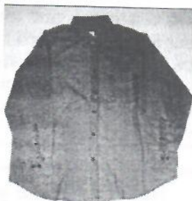
L/S Denim Shirts $35.00